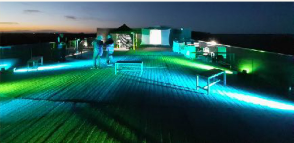
Previous Different Light Collective work includes last year's Hope & Light project, Spilsby Light Nights 2019/20, Clay Cross 2021, The Butterfly Project and more recently a project for the Lincolnshire Wildlife Trust (Pictured).