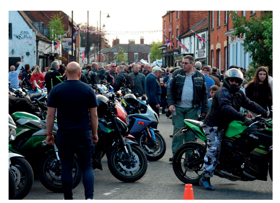
Spilsby Bike Night

Spilsby Rotary Club has provided financial support for a range of worthy causes such as the Lincolnshire Blood Bikes Service, Linkage Community Trust, Spilsby Junior Football Club, Lincs and Notts Air Ambulance and Skegness Coastwatch Station. All cash raised at local events goes directly to charities that the club supports without any deduction to cover the club's costs.